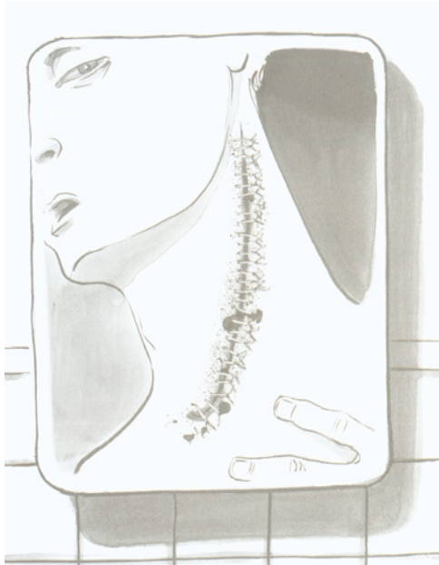
Figure. 1. Young Frankenstein (Small 190).

3. Do artists and writers who are celebrated merely for being "original," "shocking," or "experimental"-the more shocking the experiment the more original the art-purveyors of forbidden knowledge? Why or why not? (Scully)